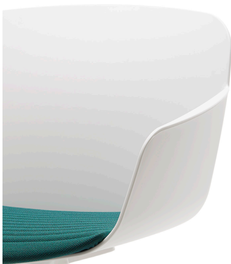
BIANCO / WHITE LIBERA MULTIPURPOSE CHAIR