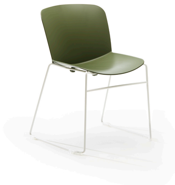
VERDE OLIVA / OLIVE GREEN LIBERA MULTIPURPOSE CHAIR