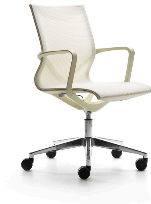
13RP10 YALTA EXECUTIVE AND GUEST CHAIR